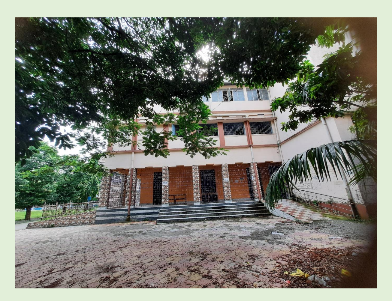
The Library Annexe Building containing the NCC Unit and the Seminar Hall (Room No. 1)