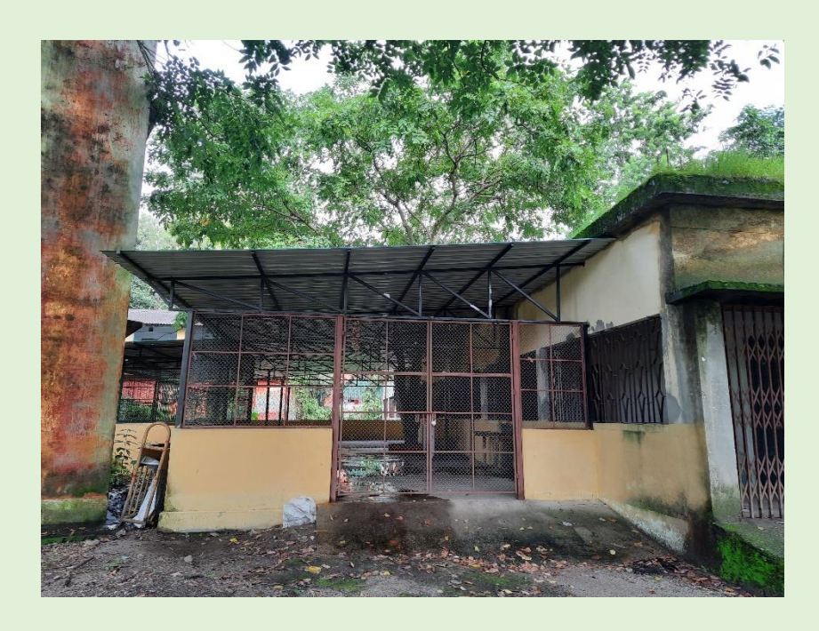
The Newly Built Cycle Stand sitting neatly beside the Room Nos. 19 & 20

Our college provides parking facility for wheeler vehicle used by teachers and students for commutation.