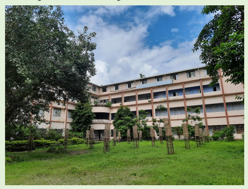
The Science Block that houses the Departments of Chemistry, Physics and Geography

2018-19 session. A student can appear at the Semester Examination only after successful completion of the regular classes in the college.