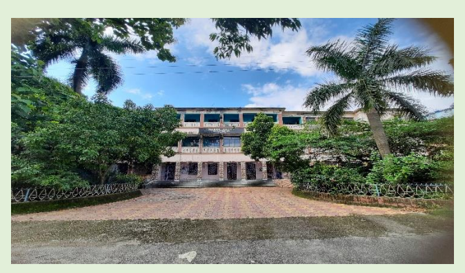
The First Building of our College

The college has well-qualified faculty and has 73 sanctioned substantive posts in various departments and 39 State Aided College Teachers, out of which many are engaged in active research work.