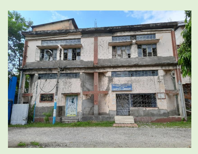
The College Library

The college library consists of 2-stories consisting of a reading room and reference section on the first floor and the Book Bank, issue section and the librarian chamber in the ground floor.