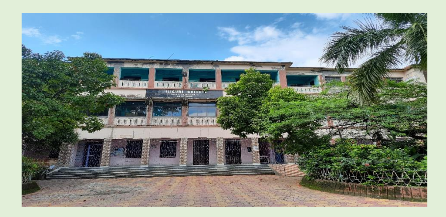
The Main Building also contains the Girls Common Room, Teachers' Common Room and the Alumni Room apart from the Botany, the Zoology and the Physiology Departments

There are two separate common rooms for both boys and girls in the college.