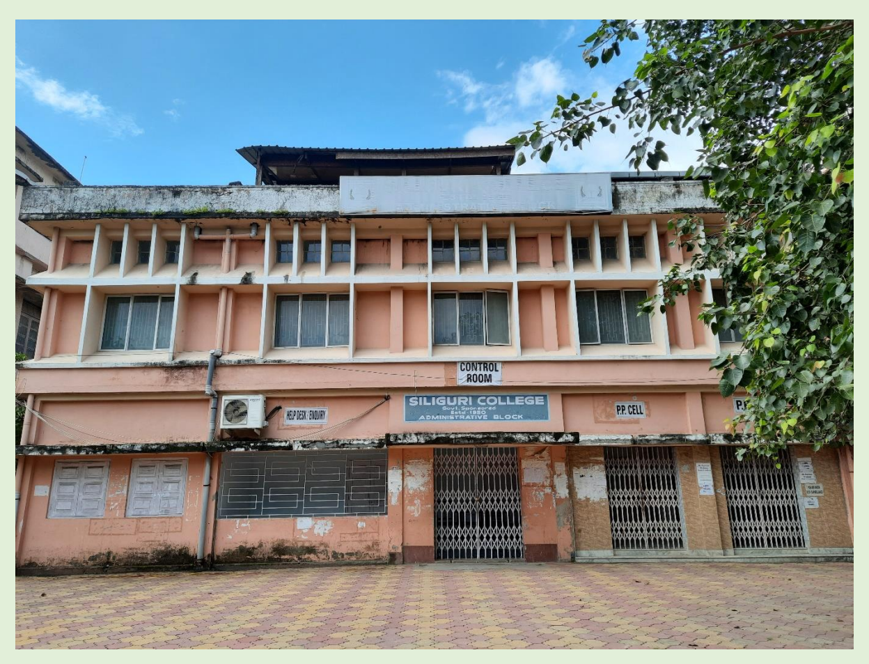
The Administrative Building houses the College Office, Principal's Chamber, the IQAC Room as well as the Departments of BCA & Computer Science, Economics, Mathematics and Statistics

Apart from the above the College offers Post Graduate courses in Bengali as well as Geography and Applied Geography, a BBA Program Course in association with Avlon and a Career Oriented Program (COP) in Travel and Tourism Management.